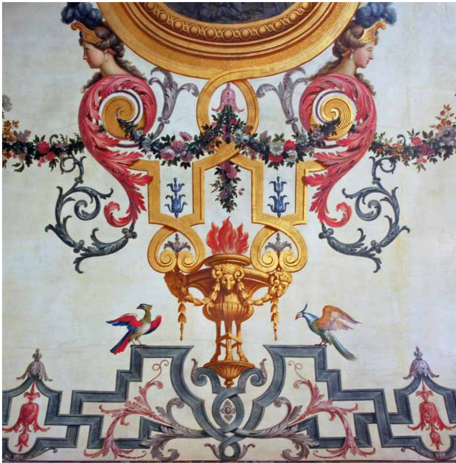
Detail from a painting on the ceiling, preserved from the years of Tessin.